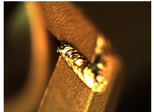
Seam Weld = 17-4 Stainless Steel

Stainless Steel -- 17-4, 316L, 316, 304L, 304 Titanium Cobalt Chrome Nitinol