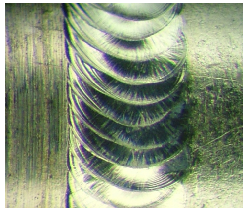
Tube Weld = 304 Stainless Steel

Tensile Testing Helium Leak Testing Torque Testing Raw Materials Management Outsourcing Manufactured Parts Electropolishing / Passivation Prototype Development Process Validation